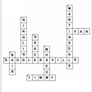
ANSWERS For the March/April Martinsdale Crossword