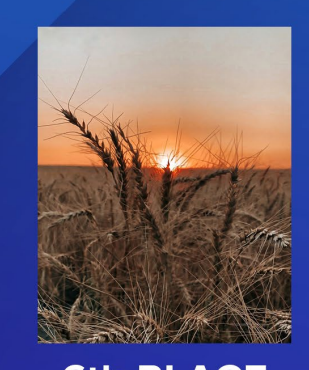
6th PLACE Ashlee Ophus