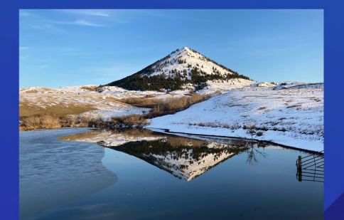
5th PLACE Emily Scofield