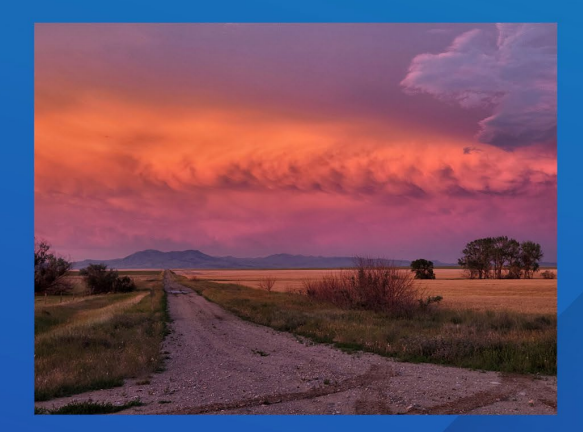
3<sup>RD</sup> PLACE Jessica Ophus