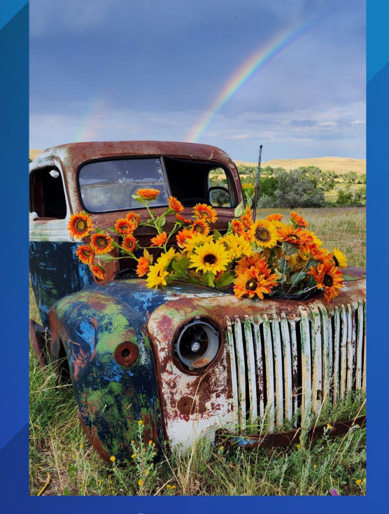
1<sup>ST</sup> PLACE Crystal Stepper