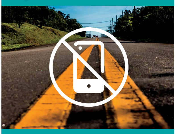
While driving, turn phone to silent mode or pull over if the text can't wait.

of the most dangerous distractions. Sending or reading one text takes your eyes off the road for an average of five seconds. At 70 mph that is one tenth of a mile. That is a lot of roads covered without any eyes on the road or hands covering the wheel of the vehicle.